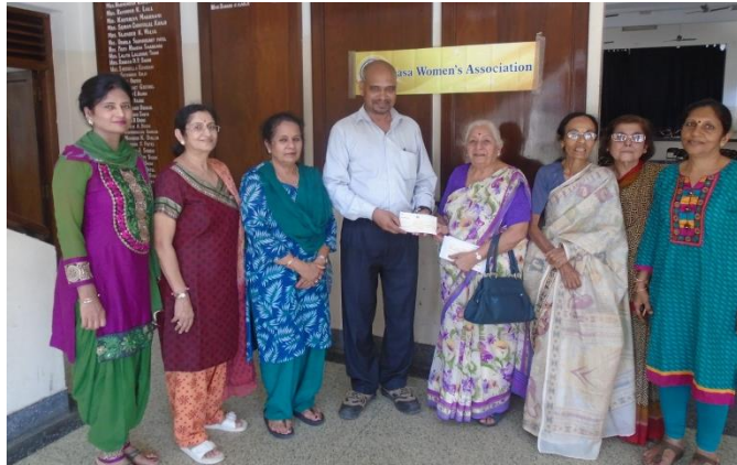
Mombasa Women's Association make a donation of Kshs 200,000/= towards the education of girls at Mabati Technical Training Institute.