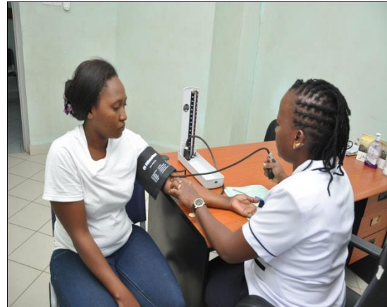
One of our nurses attends to a patient at the Medical Centre. The number of patients has increased since we started operating for 24 Hours.