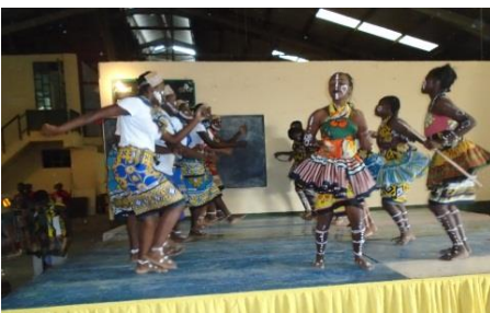
Students taking part in the Interdepartmental Dancing Competition