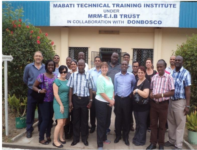
The Safal Group Marketing Team's visit to the institute in February 2015