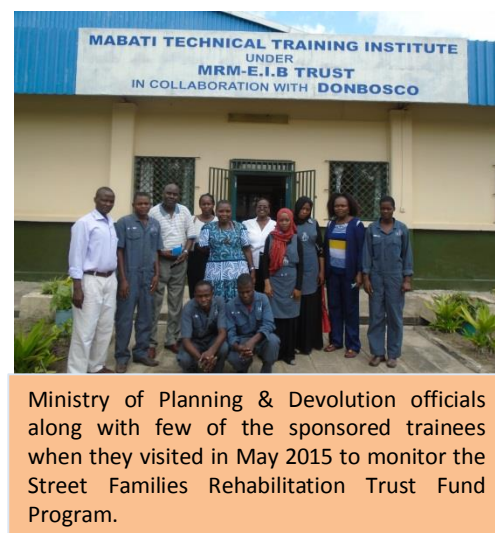
Ministry of Planning & Devolution officials along with few of the sponsored trainees when they visited in May 2015 to monitor the Street Families Rehabilitation Trust Fund Program.