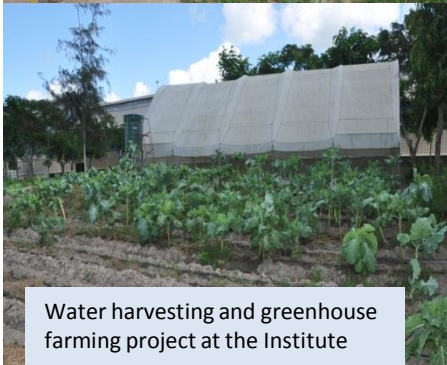
Water harvesting and greenhouse farming project at the Institute